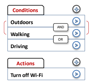
Figure 2: Mockup of the end user interface to specify "condition-action" tasks.

Tasks are represented as JavaScript programs. The CITA interpreter provides a way for JavaScript to deal with Java objects and call methods on them [7]. CITA exposes phone devices as objects — a developer can simply call methods on the object to manipulate it. This object model is convenient because it enables a developer to work with multiple phones in a single script. When a script creates multi-device tasks, CITA partitions the task into sub-tasks, and executes and coordinates sub-tasks across the devices.